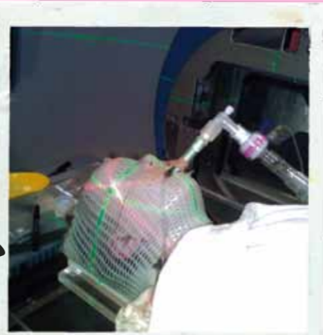
It really hurts.