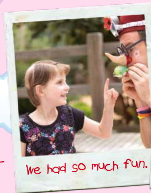
We had so much fun.